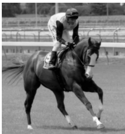
Joker's Wild, champion 2yo from the first crop of Black Minnaloushe - his dam carries six lines of Mumtaz Mahal

Copelina was sent to Fine Top, a stallion whose pedigree doubled up on elements highlighted earlier in the mare's background: Le Sancy, Sans Souci, Bruleur and Blandford. The result of the